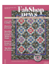
December 2005 (Issue 48)