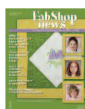
July/August 2005 (Issue 47)