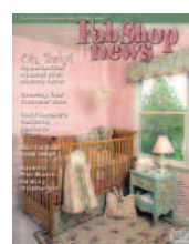
August 2006 (Issue 53)