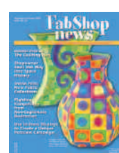
Sept/Oct 2005 (Issue 48)