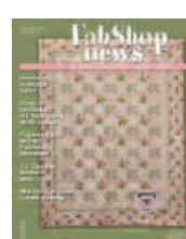
May/June 2005 (Issue 46)