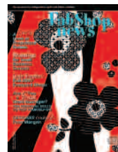
August 2007 (Issue 59)