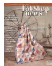
October 2006 (Issue 54)