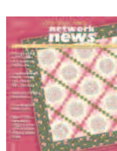
March/April 2004 (Issue 39)