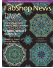
June 2009 (Issue 70)