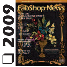
February 2009 (Issue 68)

COMPLETE YOUR SET OF BACK ISSUES! $50/YEAR OR $10/ISSUE