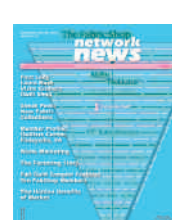
Sept/Oct 2004 (Issue 42)