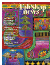
December 2007 (Issue 61)