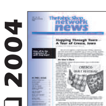
Jan/Feb 2004 (Issue 38)