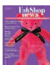
March/April 2005 (Issue 45)