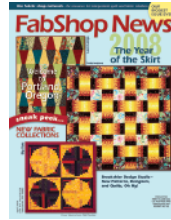
April 2008 (Issue 63)