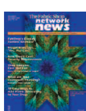
Nov/Dec 2004 (Issue 43)

Subtotal $ _____ WA residents add 8.2% sales tax $ _____ TOTAL AMOUNT: $ _____