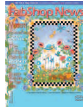
August 2008 (Issue 65)