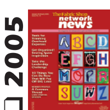
Jan/Feb 2005 (Issue 44)