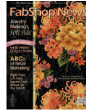
October 2008 (Issue 66)