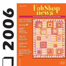
February 2006 (Issue 50)