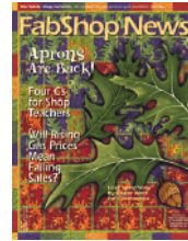
June 2008 (Issue 64)