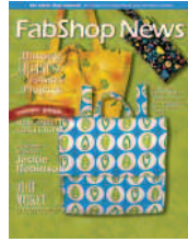
October 2009 (Issue 72)

Mail or fax the form to The Fabric Shop Network, Inc. P.O. Box 820128 Vancouver, WA 98682-0003 (360) 892-6500 • fax (360) 892-6700