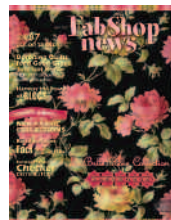
April 2007 (Issue 57)