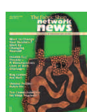
July/August 2004 (Issue 41)