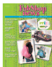
April 2006 (Issue 51)