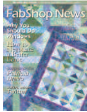
August 2009 (Issue 71)