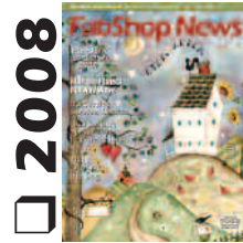
February 2008 (Issue 62)

Mail or fax the form to The Fabric Shop Network, Inc. P.O. Box 820128 Vancouver, WA 98682-0003 (360) 892-6500 • fax (360) 892-6700