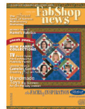
October 2007 (Issue 60)