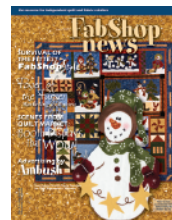
June 2007 (Issue 58)