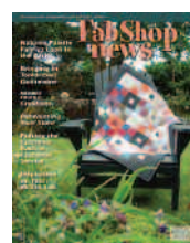
June 2006 (Issue 52)