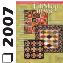
February 2007 (Issue 56)