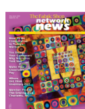
May/June 2004 (Issue 40)